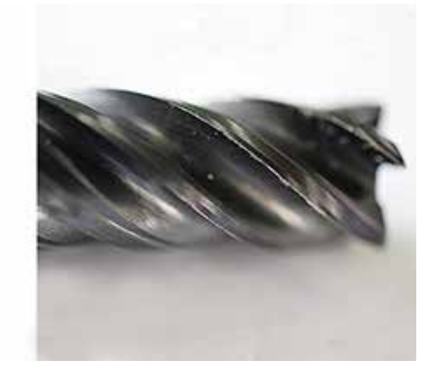
Comparison of wear on tool blade, machining, material – left: with powRgrip, right: without powRgrip.