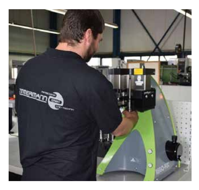
powRgrip system: A unique tool clamping system that clamps tools in seconds at the touch of a button and without heating, and that also has a sustainably precise concentricity even for the smallest tool diameters.